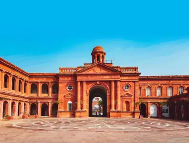
The Partition Museum in Amritsar

Mumbai Mirror / Nov 24, 2020, 04.45 AM IST